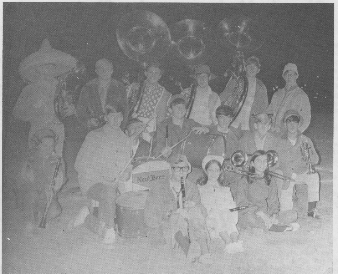
BACK AGAIN —The "Tin Can Band" of son. This time, the group is sporting new uniforms. for NBHS supporters during basketball season.

Since sixty per cent of the words of our entire English language have in one way or another, directly or indirectly, been derived from the Roman language.