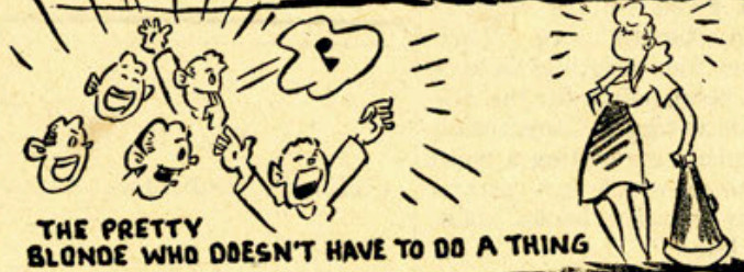
THE PRETTY BLONDE WHO DOESN'T HAVE TO DO A THING