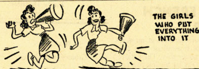
THE GIRLS WHO PUT EVERYTHING INTO IT