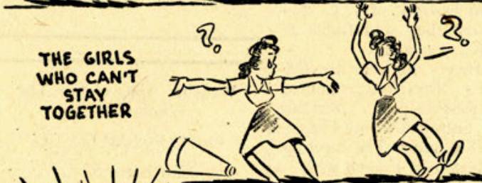
THE GIRLS WHO CAN'T STAY TOGETHER